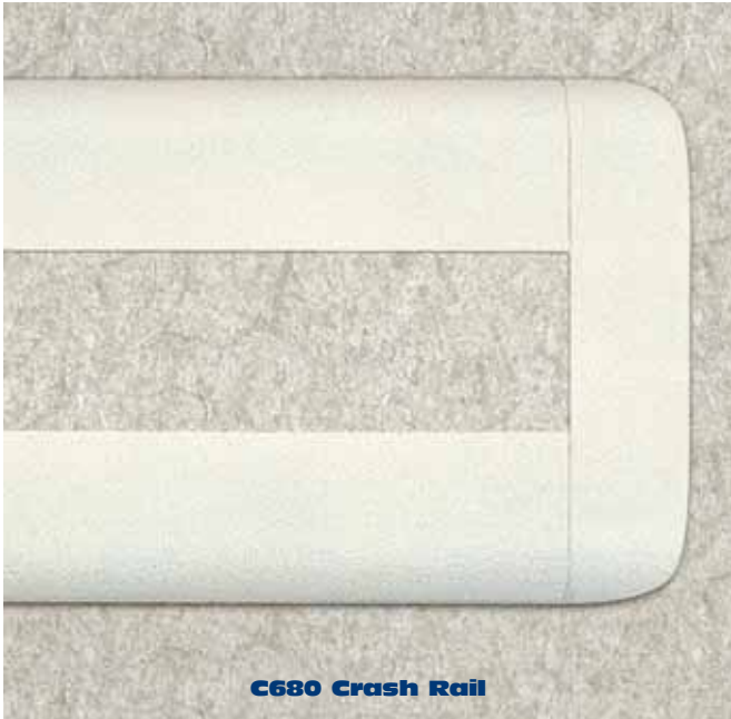
C680 Crash Rail

KOROGARD C610 and C680 Crash Rails are 6" (152.4mm) rails with full-length vinyl bumpers and continuous aluminum retainers. A 2" (50.8mm) accent strip is added to the profile extrusion to add contrast and design options. The accent strip in the C610 Crash Rail is a solid color, while the C680 Crash Rail has a strip of KOROSEAL ® or VICRTEX ® Flexible Wallcovering. The C610 Crash Rail is ideal for medium- to high-impact areas, and the C680 Crash Rail is best suited for low-impact areas. End and corner caps are available either as patented foam cushion or as rigid plastic.